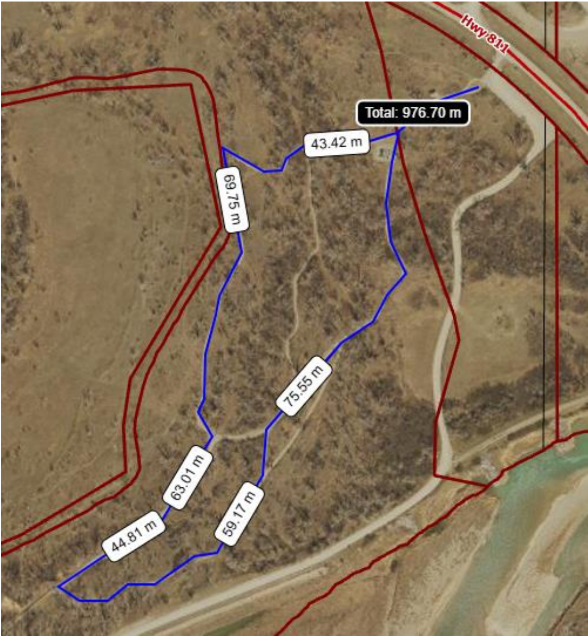
Figure 2 Pathway