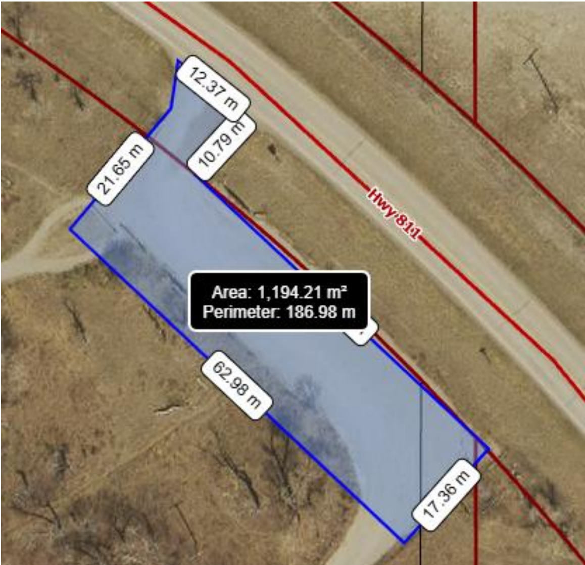
Figure 3 Parking Lot