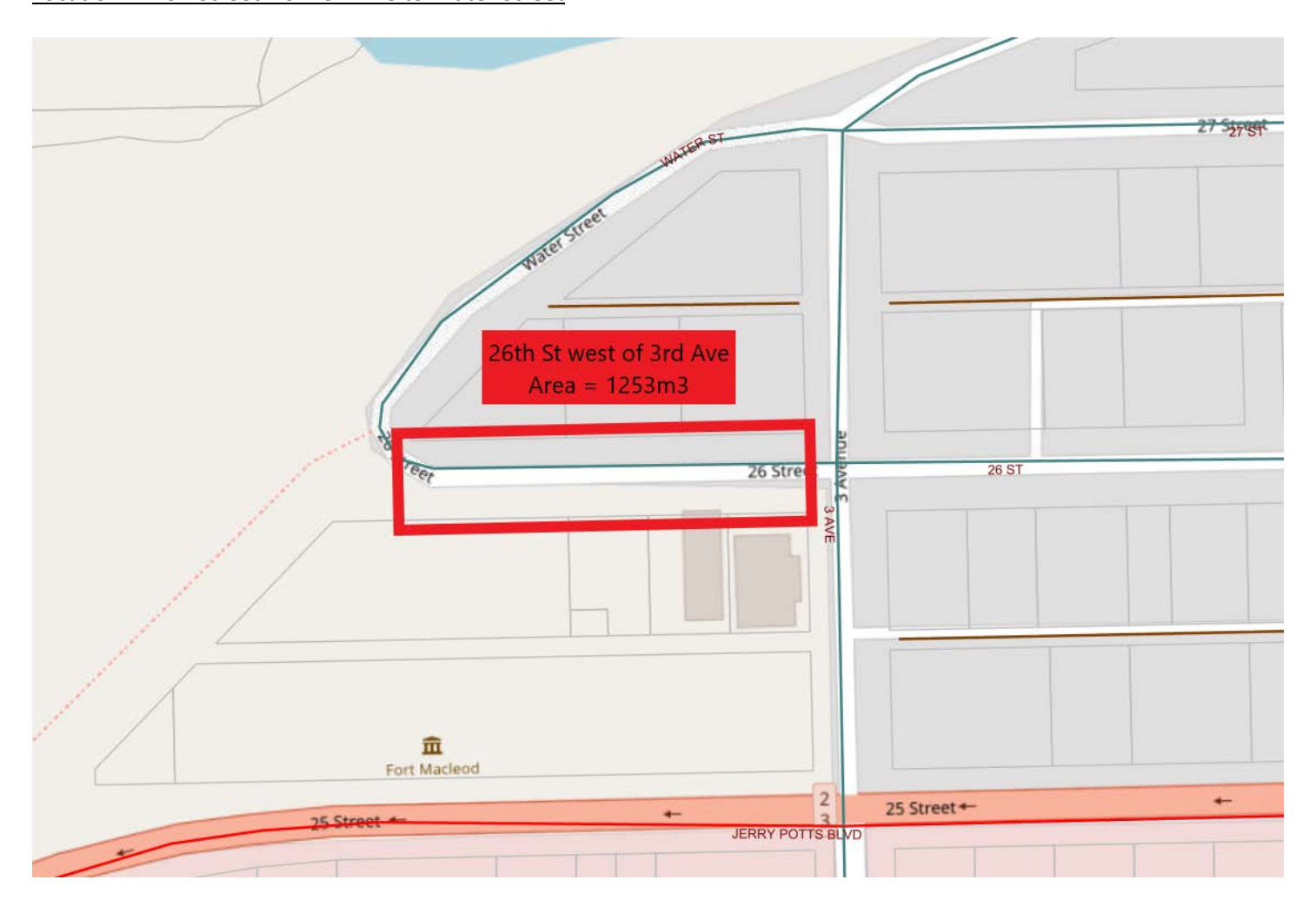
Location 1: 26<sup>th</sup> Street from 3<sup>nd</sup> Ave to Water Street